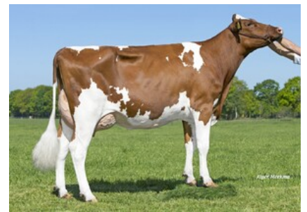
M: Red Rocks Massia 155