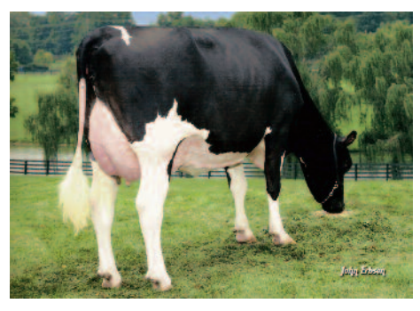
Morningview Oman Annette VG-87 is the dam of Amaya and out of Judy's well-known granddaughter April VG-89. Annette has several sons with high genomic proofs.

And the top prices fetched by Judy's offspring in the recent past as well underpin this rating. Especially Amaya takes center stage. Scored VG-86 as a 2-year-old, that Toystory daughter is contracted by all major North American Al studs. De-Su Holsteins purchased Amaya at $75,000 but now has one of the "hottest" young bull dams with a super fancy pedigree in