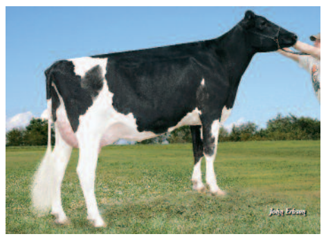
At $75,000 Morningview Tstory Amaya VG-86 was the sale topper at the Morningview Sale. She has contracts with all leading AI studs in North America.

he prices breeders are ready to pay for individual animals appear to be marvelous indicators for those animals' importance within the population. In this case the amounts of $75,000 paid for Morningview Tstory Amaya VG-86, or $45,000 for her dam, Morningview Oman Annette VG-87, or a total of $59,000 for 2 Socrates daughters from Amaya would serve as indication of the exceptional popularity and recognition. The sale that took place in early June in the barn where Judy was born and, typically enough, carried the name "Morningview's Tribute to Converse Judy Sale", provided exact-