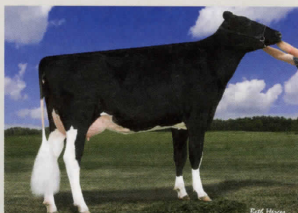
Farnear Gold Banji EX-91 is the great-grand-dam of the Nr.1 UK Type sire Missan (3.92), who also ranks highly in Germany.