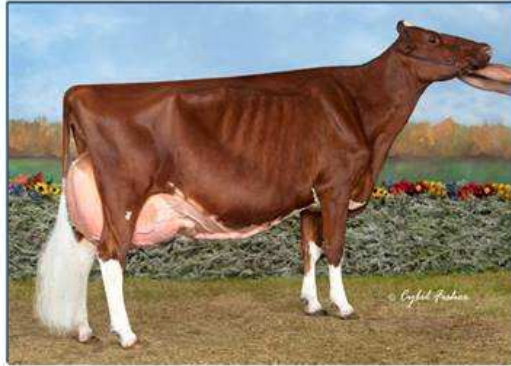
Moedersmoeder: KHW Regiment Apple Red EX-96

Eigenaar/fokker: A-L-H Genetics, Damwoude NL 715712726 Geboren: 3-12-2016