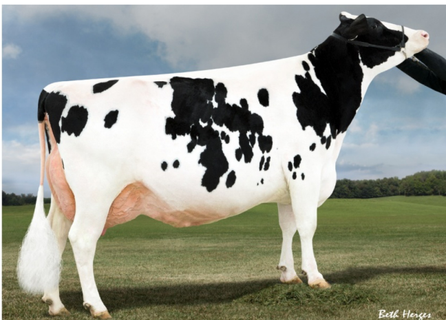
LARCREST CRIMSON ET (EX-92) Granddam of SEXTING