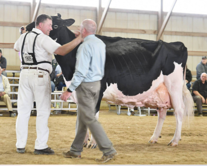
Subliminal was named Grand Champion of the Midwest Spring National Holstein Show in 2021.

In May 2021, Subliminal received a distinction not many cows in the Holstein breed can boast. She was classified