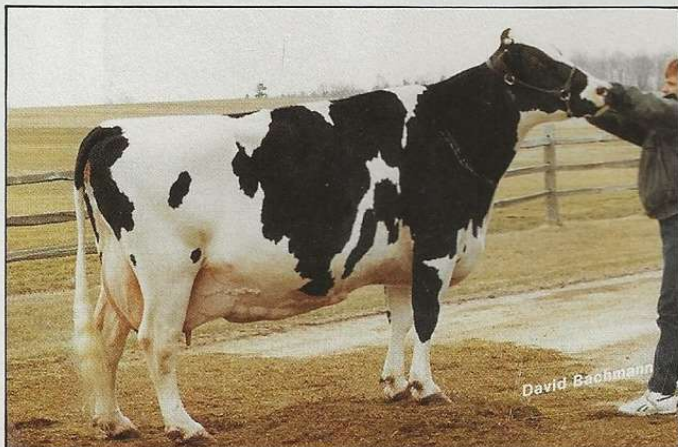
Million-Heir-Prestige-Charo EX 96 - 5E - GMD 365 - 11.09 - 3X - 15 313 kg - 4.3%. Elle a produit jusque là un total de 129 173 kg de lait à 4,2%; charo a maintenant 9 filles classées EX ou VG et ayant produit plus de 500 kg de gras. / Her lifetime production stands at 129,173 kg milk at 4.2%. She now has 9 Excellent or Good daughters with over 500kg F.