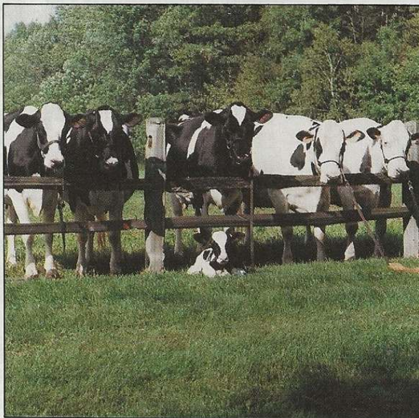
5 vaches de la famille Matilda. En plus de Fond-Matt-Matilda placée à droite et présentée également en photo, nous avons: / 5 cows from the Matilda line. Fond-Matt-Matilda is pictured on right. The other cows are: Pinehurst-Precious EX 95-4E-GMD 365 - 9.05 - 3X - 16180 kg - 3.5%. Pinehurst-Pleasure EX 95-4E-GMD 365 - 8.09 - 3X - 16240 kg - 3.6%. Pinehurst-Coquette EX 95-3E-GMD 365 - 4.07 - 3X - 18337 kg - 3.6%. Pinehurst-Serenade EX 92-2E 365 - 4.05 - 3X - 15650 kg - 3.9%.

This high milk production is impressive, but it is also accomplished by excellent type cows. Among the 110 milking cows are 73 classified Excellent, 48 Very Good and 9 Good Plus. The BAA is 111.7. Pinehurst has bred 200 Excellent cows, and they have developed 254 more Excellents! In the present herd, one cow completes 9 generations of Excellent. Another cow completes 8 generations of uninterrupted Excellents.