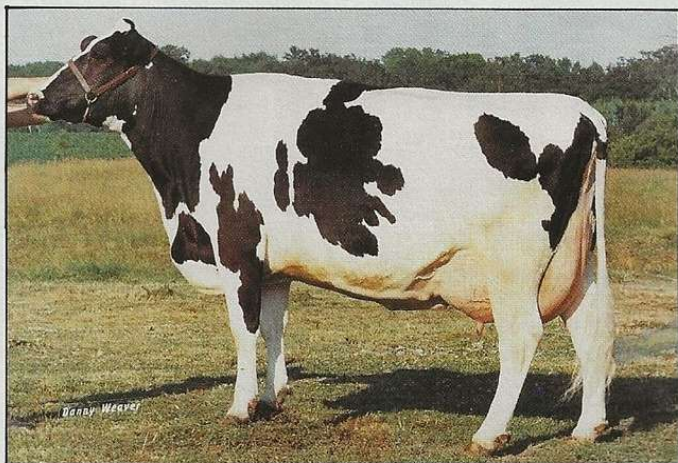
Dolvic-Fury-Bubaleah EX 97-2E 365 - 6.06 - 3X - 12 544 kg - 3.8%. Elle est la mère de Copyright / she is dam of Copyright.