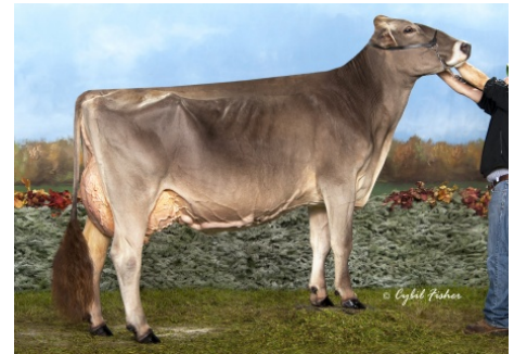
Dam: Jo-Dee Nemo Risky '2E 94 E 94 MS' Lifetime: 1,968d 143,950M 5,288F 4,644P Reserve All-American 2014 & Honorable Mention All-American 2012, '13 & '16 Member of All-American Sr. Best 3 Females 2013 & '14