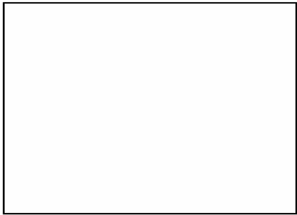
Dam: T-Spruce Crown-ET