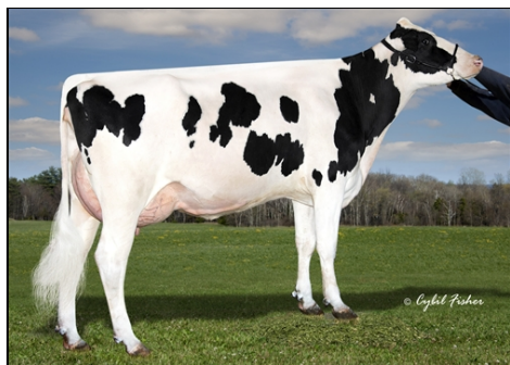
MAIN-DRAG RUBICON EMAIL GRANDDAM