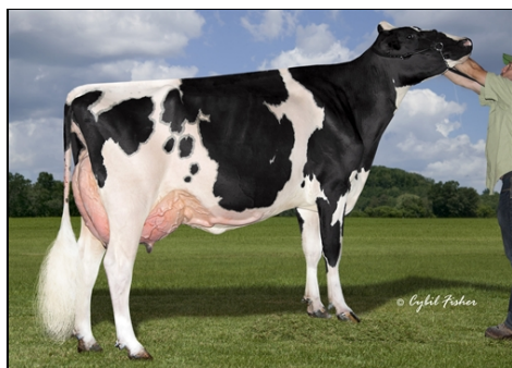
WINTERHLM-WG BAX ELATED FOURTH DAM