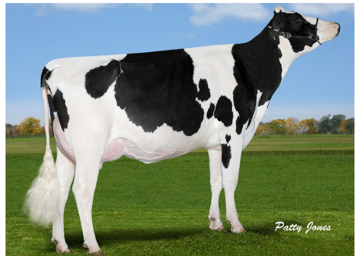
Great Granddam: Gen-I-Beq Snowman Spring RDC