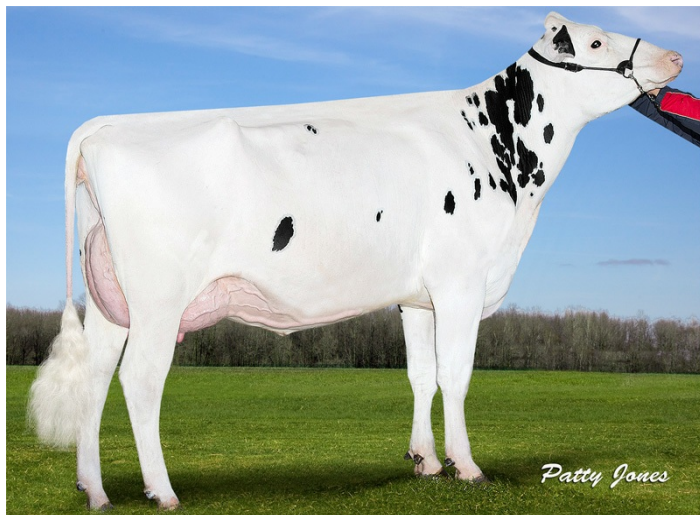
Granddam: Snowbiz Brewmaster Swan RDC