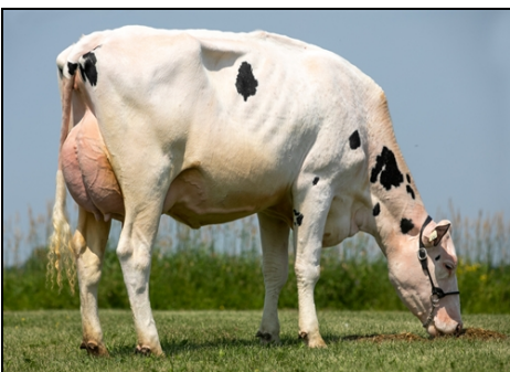
ANTIA ALLIGATOR POLLA