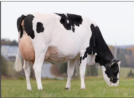
ROQUET CARAIBES ALIGATOR