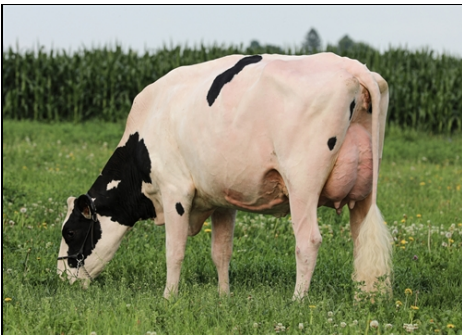
COTI ALLIGATOR CORANE