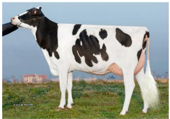
Daughter: Indevra Inseme Barbarella