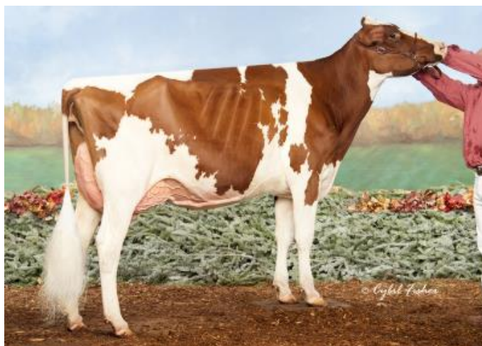
Dtr: Shluter Shelby Lee-Red VG-89 2yr