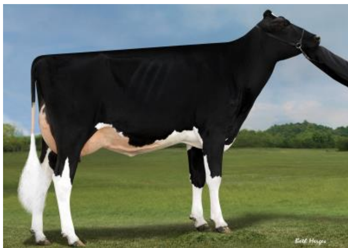
Daughter: Luck-E Awesome Audio-ET