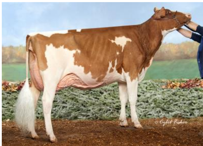
Dtr: Siemers Awesome Great-Red VG-89 2yr

Sire: Apples Absolute-Red-ET CVC CV TL TD Dam: Luck-E Advent Asia-ET RC EX-94 04-10 2x 365d 32680m 5.7 1863f 3.2 1045p MGS: KHW Kite Advent-RED-ET TV TL TD EX-94 MGD: Luck-E Blitz Australia-ET TV TL VG-87 DOM 02-02 2x 365d 37990m 4.0 1528f 2.8 1060p MGGS: Fustead Emory Blitz-ET TV TL EX-92 MGGD: Luck-E Skychief Arizona-ET EX-90 GMD DOM 05-01 2x 365d 56280m 5.1 2872f 3.1 1749p