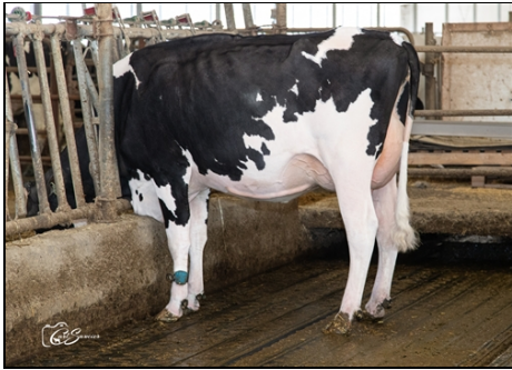
PELLERAT WEBSTER P DECCOX DAUGHTER