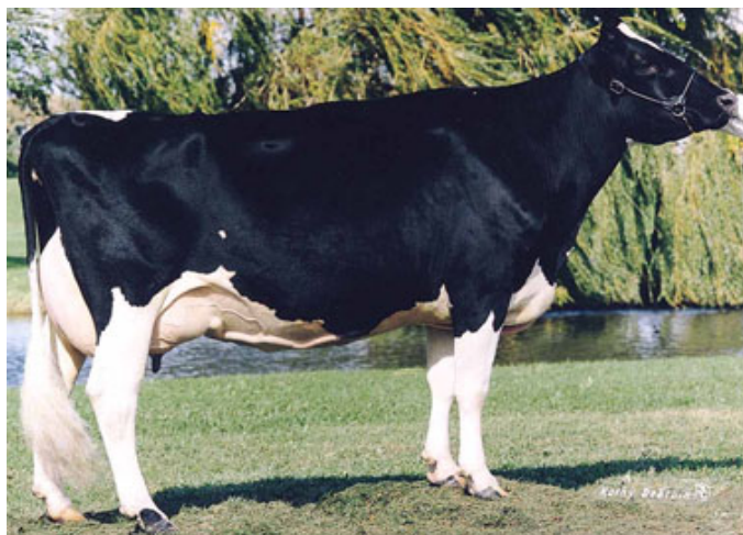
Dam: Snow-N Denises Dellia

Sire: Emprise Bell Elton CV BL TD EX-95 Dam: Snow-N Denises Dellia TV TL EX-95 2E GMD DOM 07-06 2x 365d 35610m 4.0 1431f 2.9 1035p MGS: Walkway Chief Mark TL TD VG-87 MGD: Snow-N Dorys Denise EX-90 2E GMD DOM 5-09 2x 365d 33350m 3.8 1256f 3.1 1038p