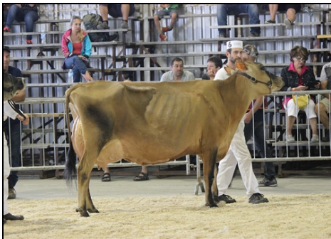
ST-LO TOPEKA DARLIA DAM