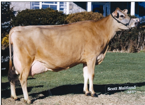
NORVAL ACRES LAD DARLENE THIRD DAM