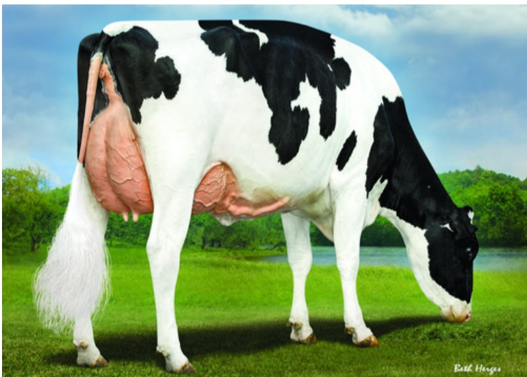
DTR: Le-O-La Artist Lexis-ET VG-86, Le-O-La Holsteins, Peosta, IA