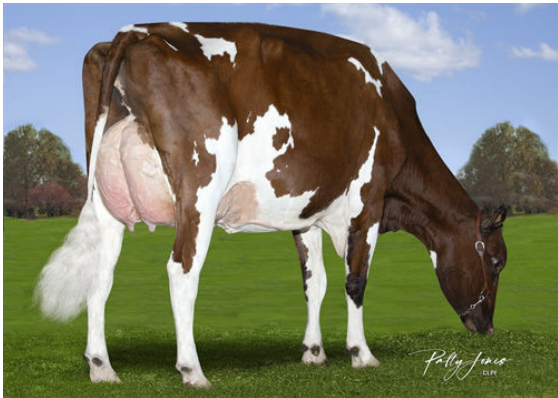
H-BRIDGE RANGER DENISE RAE RED DAUGHTER