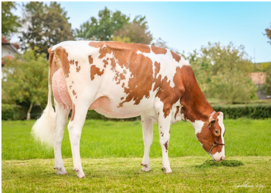
B.O.A. RANGER CARAMBA DAUGHTER