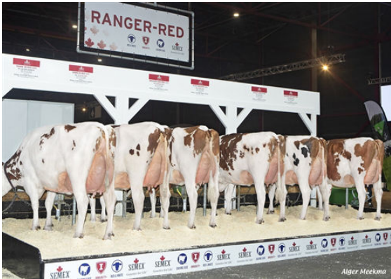
RANGER-RED DAUGHTER GROUP HHH SHOW, NETHERLANDS