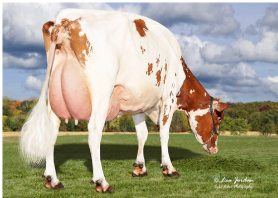
AOT SWINGMAN HALIA-RED DAM