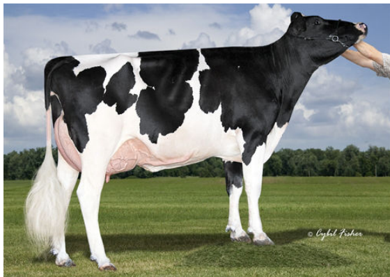
AOT SALVATORE HICCUP GRANDDAM