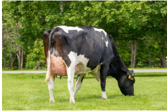
DAM Aurora Perfect 23719-ET