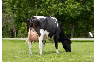
DAM Aurora Perfect 23719-ET