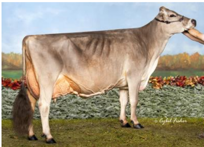
Dam: Brown Heaven Glenn Fantasy EX-97

Sire: Jo-Dee Nemo Richard ET ARF Dam: Brown Heaven Glenn Fantasy EX-97 4/00 365d 2x 30,091m 3.8 1,151f 3.6 1,096p MGS: Schamaun Bs Gordon Glenn-ET WEF SMF SDF MGD: Swiss Dream Agenda Faith ET EX-90 5/02 365d 2x 24,998m 4.3 1,071f 3.6 899p MGGS: BLessing Bnk Agenda ET *TM (D D TM) MGGD: Swiss Dream Cartoon Florida EX-92