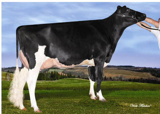
LINDENRIGHT BRADNICK MOOVIN ON FIFTH DAM