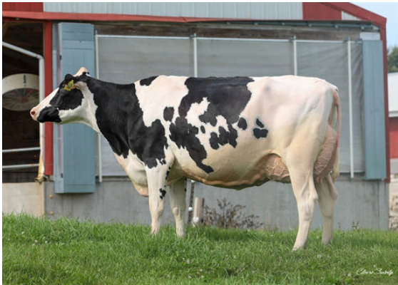
AOT DELUXE HI-LIGHTED DAM