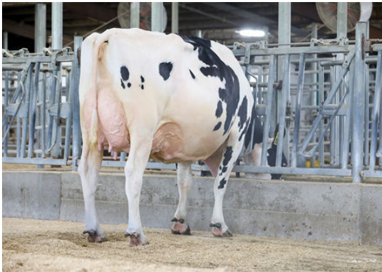
AOT DELUXE HI-LIGHTED DAM