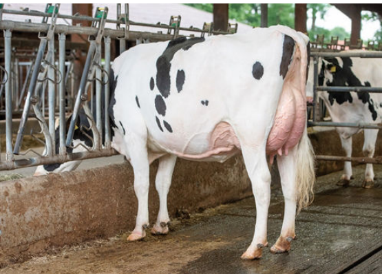
GRIMMELMANN'S BE HOT DAUGHTER