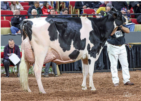
LADYROSE CAUGHT YOUR EYE DAUGHTER