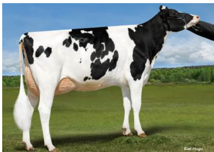
Daughter: Farnear Captain 3005