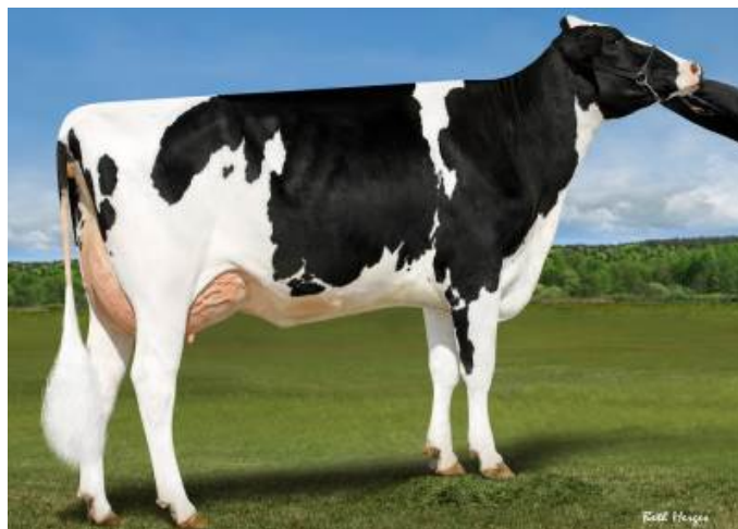
Daughter: Genosource Bravo 47586-ET VG-86

MGS: Farnear Tango Sabre 1973-ET TC TD TE TL TR TV TY MGD: Peak Menna Ahead 850-ET VG-85 02-09 2x 305d 39520m 2.9 1163f 3.1 1232p MGGS: Velthuis B Ahead TD TL TR TV TY MGGD: S-S-I Shamrock Menna7392-ET VG-85 01-11 3x 365d 26870m 4.1 1090f 3.0 810p