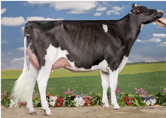
SABBIONA 1607 DAUGHTER