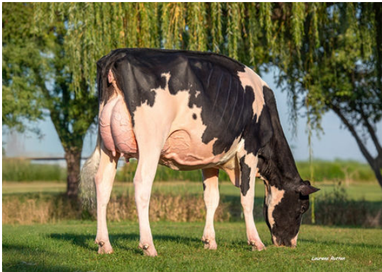
GENOSOURCE JAWDROPPER DAUGHTER