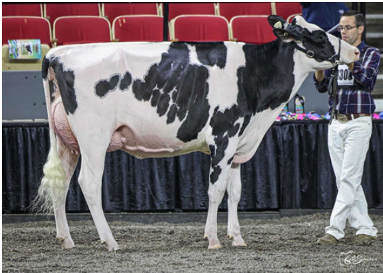
MARTIN-VIEW BULLSEYE CROSBY DAUGHTER