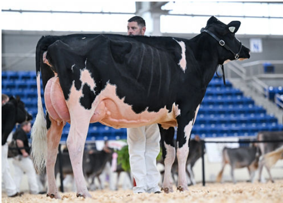
PETITCLERC BULLSEYE ABELIA DAUGHTER