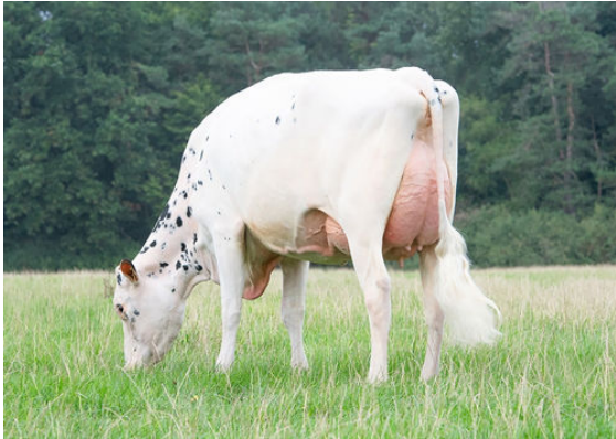
SEIPELS BULLSEYE KAYLEE DAUGHTER