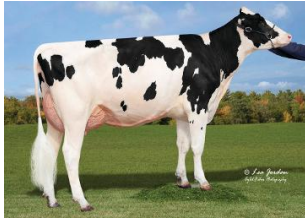
Clear-Echo Sheepster 6083-ET