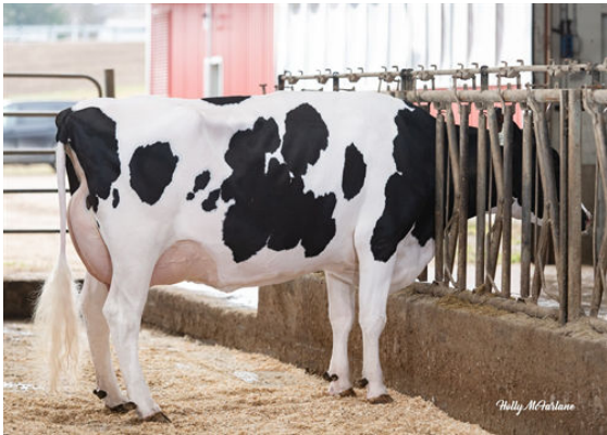
COOKIECUTTER A HOMILY DAM