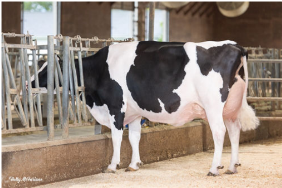
MYSTIQUE LAMBDA ANIS