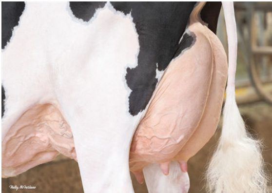
MYSTIQUE LAMBDA ANIS