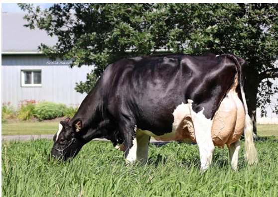
MYSTIQUE EXTREME ABRICOT