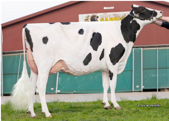
SABBIONA 475 DAM