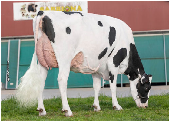
SABBIONA 475 DAM