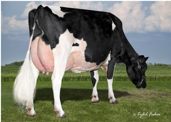
COOKIECUTTER MOG HANKER FOURTH DAM