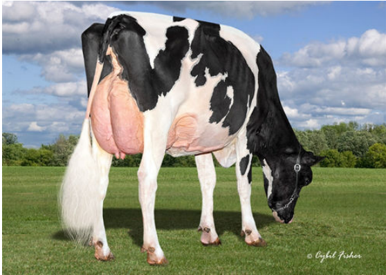
SIEMERS DOC HANAN 28286 GRANDDAM