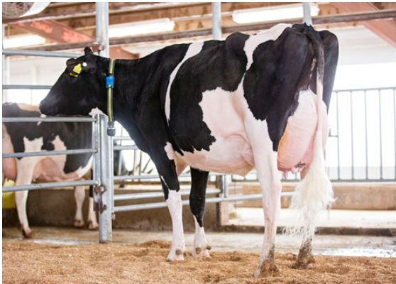
SIEMERS LSTR HANAN 33317 DAM