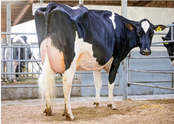
SIEMERS LMDA PARIS 27856 GRANDDAM