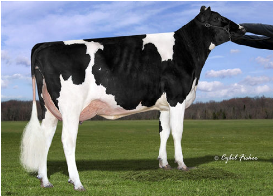
SIEMERS DENVER PARIS THIRD DAM