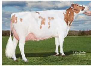
MGD Trent-Way-JS Redzone-Red-ET