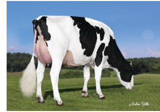
MGGD Trent-Way-JS Rona-ET