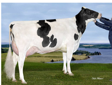
Alexerin Marlon 1763 Alexerin Dairy Inc.; Manotick, ON