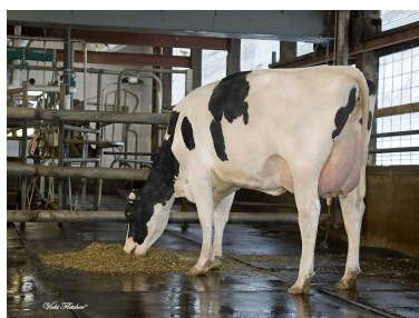
Alexerin Marlon 1763 Alexerin Dairy Inc.; Manotick, ON