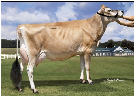
LYON CELEBRITY CECE GRANDDAM