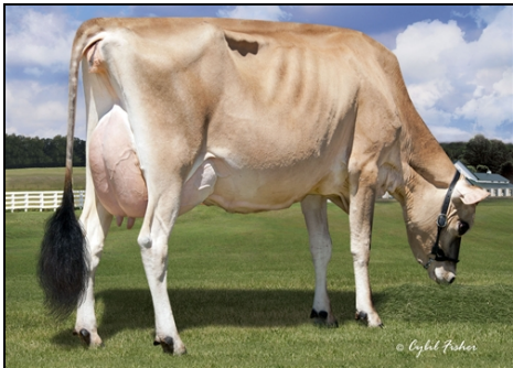
LYON CELEBRITY CECE GRANDDAM