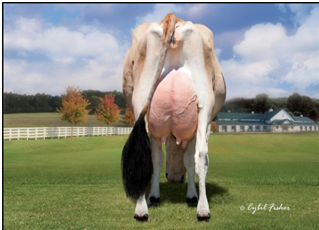
LYON CELEBRITY CECE GRANDDAM