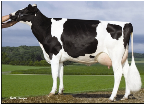
SANDY-VALLEY PLANE SAPPHIRE FOURTH DAM