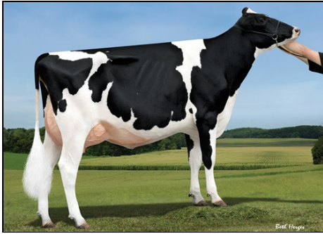
SANDY-VALLEY BL PARADISE GRANDDAM