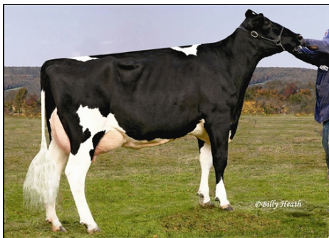
COOKIECUTTER GLD HOLLER FIFTH DAM