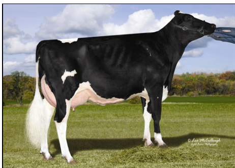
COOKIECUTTER MOM HALO FOURTH DAM