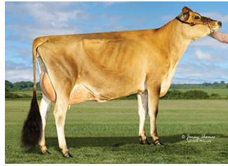
Hard Core Casino Flashy