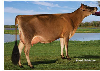
Claquato Fancy Casino