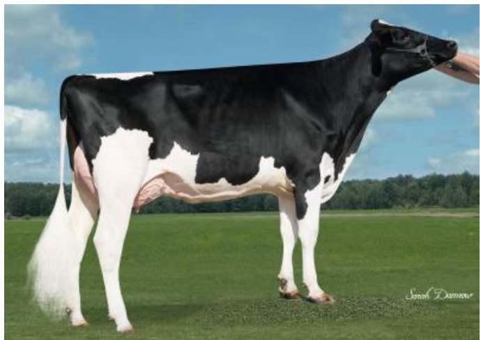
Daughter: Simple Dreams MD Cloe