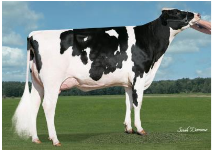
Daughter: Simple Dreams MD Candi

Sire: Mountfield Ssi Dcy Mogul-ET TR TV TL TY TD Dam: Miss Ocd Robst Delicious-ET VG-87 GMD DOM 02-05 2x 365d 33780m 3.3 1121f 3.1 1047p MGS: Roylane Socra Robust-ET TR TV TL TD MGD: OCD Planet Danica-ET EX-93 DOM 03-01 3x 365d 39240m 3.5 1384f 3.0 1166p MGGs: Ensenada Taboo Planet-ET TR TV TL TY TD EX-90 MGGD: Miss Elegant Delight-ET VG-88 DOM 02-02 3x 305d 27850m 3.4 958f 2.9 803p