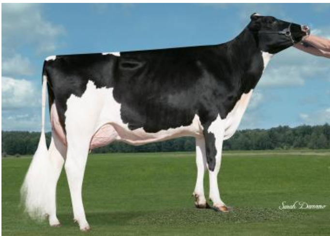
Daughter: Simple Dreams DLTA Case