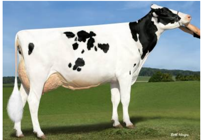
Daughter: Sandy-Valley ETernity-ET EX-92