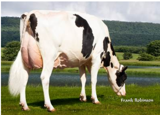
Daughter: Welcome-Tel Rubicon Pipa EX-91 92-MS