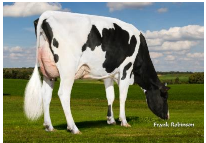
Daughter: Edg Etty Rubi 54594-ET