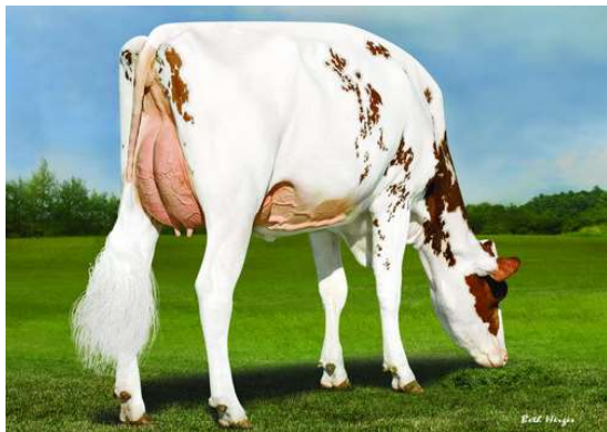
DTR: Jeffrey-Way Ad Activity-Red VG-86, Jeffrey-Way Holsteins, Belleville, WI