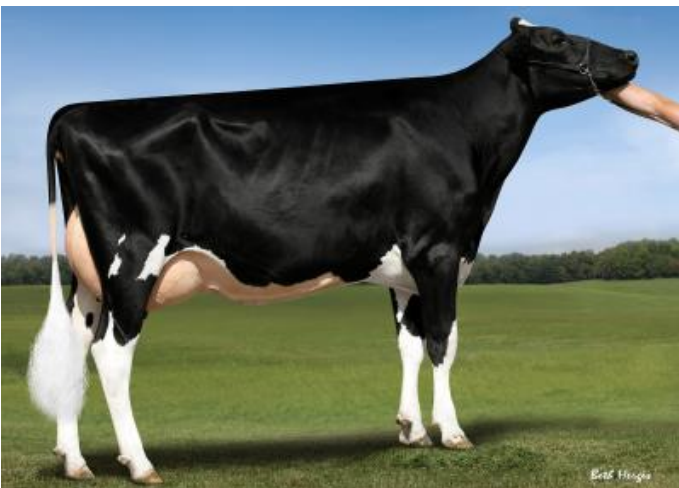
Dam: Genosource Sabre 35223-ET VG-85