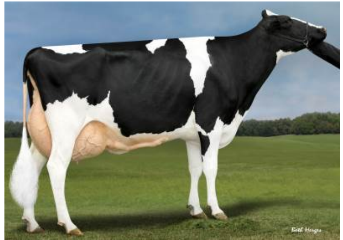
MGD: Peak Menna Ahead 850-ET EX-91