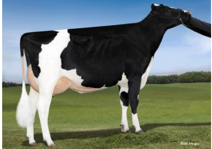
Dam: Ms Farnear Trudy Thyme-ET

MGGs: Amighetti Numero Uno-ET TV TL TY MGGD: Tranquillity Ac Dreary Trac-E VG-85