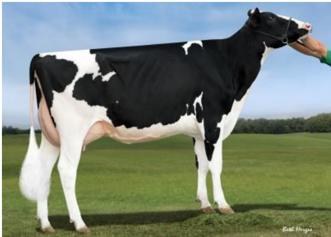
MGD: Edg Trac Uno Trudy