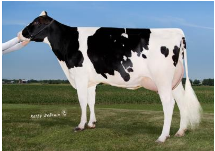
MGD: Pine-TRee 9882 Prof 7019-ET

Sire: T-Spruce 751 Dam: Pine-TRee 7019 Medl 7883-ET 02-00 2x 365d 23780m 4.8 1152f 3.5 828p MGS: ABS Medley-ET MGD: Pine-TRee 9882 Prof 7019-ET VG-86 MGGs: S-S-I Partyrock Profit-ET MGGD: Ocd Supersire 9882-ET VG-86 02-01 3x 365d 31870m 4.1 1310f 3.2 1023p