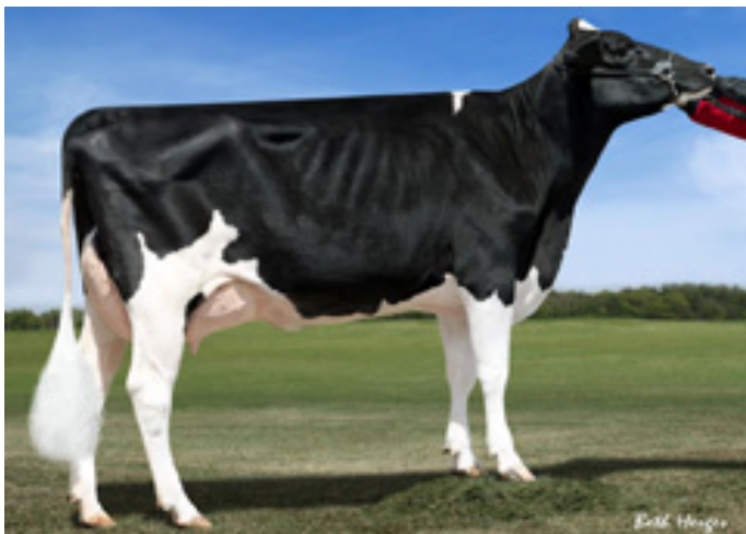
MGGD: Kellercrest Manoman Lacy-ET