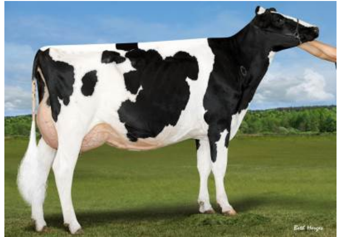
Dam: Aot Eisaku Habitan 9106-ET

MGGS: Mr Mogul Delta 1427-ET MGGD: Cookiecutter Day Haley-ET VG-88 02-00 3x 365d 35140m 3.9 1379f 3.2 1126p