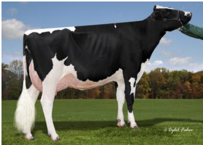
MGD: Cookiecutter Dta Habitan-ET